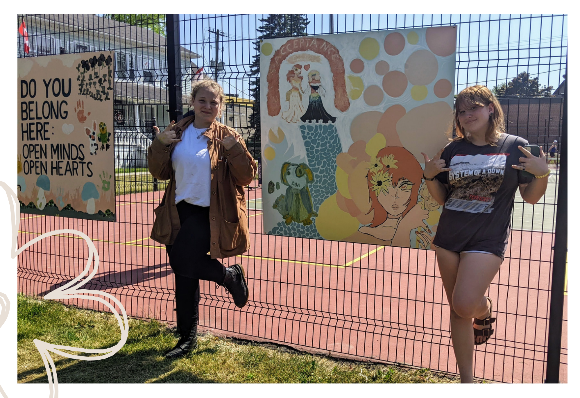
Do You Belong Here murals co-created by Youth and County Arts facilitators. On display at Benson Park, Picton, summer 2023.