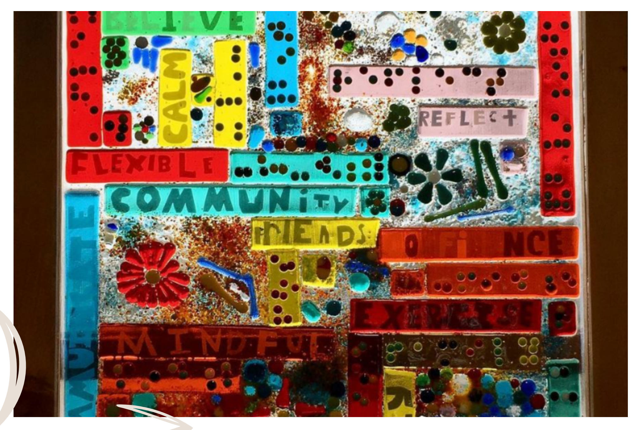
Fused glass hanging panel co-created by County youth and Kirei Samuel.