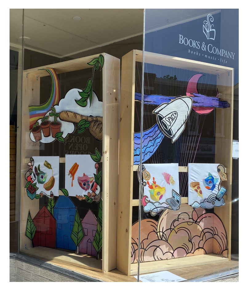
Looking Out, Looking Up in Books & Company's storefront, summer 2020

"This summer I was able to pick up and focus on my hand embroidery ... Receiving a Public Art Grant from the Prince Edward County Arts Council allowed me to build out these embroidered works. This summer I saw my stitching improve and my work became cohesive and more complete than ever before."